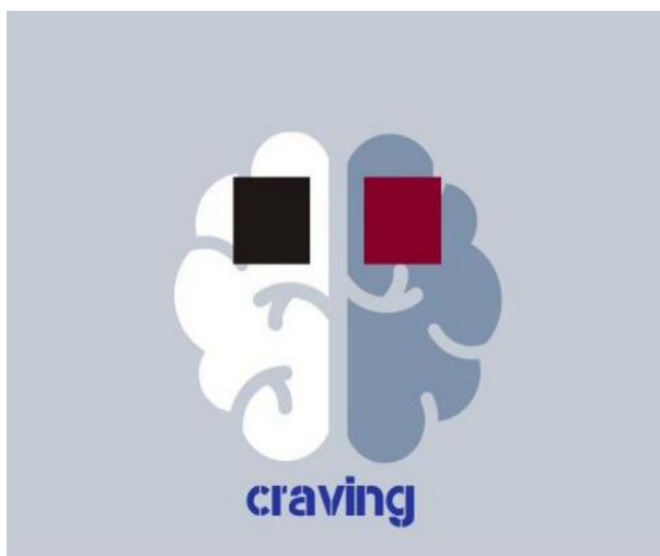
Figure 3. Electrodes of tDCS position