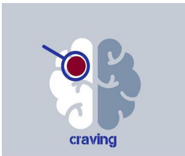
Figure 2. Coil location in rTMS

The protocols with the most size effects were anodal tDCS with 2mA by 30 minutes over the right DLPFC ( g = 0.45 ; 95%CI 0.328-0.583; p < 0.001 ), and high frequency of rTMS (10Hz), 100% motor threshold, over the left DLPFC ( g = 1.116 ; 95%CI 0.597-1.634; p < 0.001 ). The positions of coils and electrodes are in Figure 2 and 3 respectively.