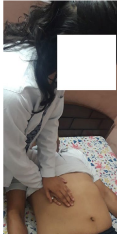
Figure 3. Visceral manipulation in the transversal plane