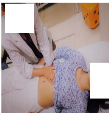
Figure 1. Placebo manipulation technique

Mobility treatment technique in sagittal plane -The subject was in the side lying position with right side up and both legs bent towards the chest and the therapist stood behind the patient towards the head side. Therapist placed his left hand vertically on the posterior side of the fifth/sixth rib at the right costal arch and the right hand vertically on the anteriorly side of the right costal arch. Both thumbs pointing towards the right shoulder. Therapist placed the hands to load the fascia to connect the liver and follow the movement (anterior/posterior rolling) of the liver in the direction of ease. This cycle was repeated for 3 repetitions.