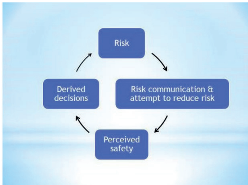
Figure 2: The „safety loop“. Objective risks induce the communication of risks and attempts to reduce the risks. The risk communication leads to the subjective perception of the risks that is different in different individuals. The subjective perception is the basis for the derived decisions and the decisions influence the risk.

based on the subjective perceptions of the risks and finally the effects of the subjective decisions on the modulation of the objective risk.